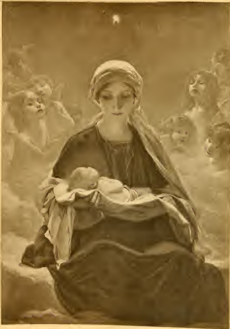
Child of prophecy and longing, Of slow ages of desire.